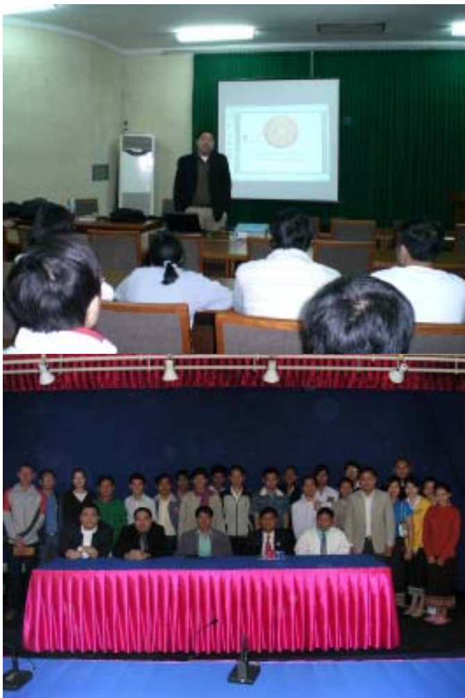
A number of students showing interests in AUN/SEED-Net programs during KMITL promotional trips to Laos and Vietnam in January 2007

We are now approaching the end of Phase I for the AUN/SEED-Net, and the outcome from the project has been proved successfully in human resource development among South East Asian countries. We hope that this relationship among member institutions will create the beneficial enhancement of South East Asian countries in Engineering Education.